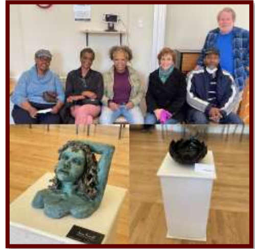
2021 Art Show: Pottery through the Pandemic

In July 2021, after 15 months of closure due to the COVID-19 pandemic, CIP reopened its building for on-site classes and programs. Activities were re-introduced with safety precautions and occupancy restrictions to allow for social distancing. Online classes continued, and, as the infection rates in Philadelphia fell, CIP saw increased attendance from both new and returning members.