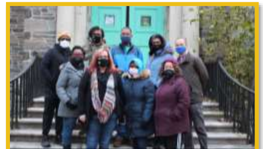
CIP Board Members and Executive Director, Winter Festival