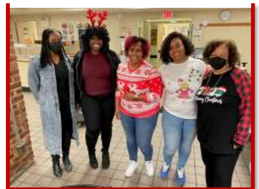
CIP Staff Holiday Party