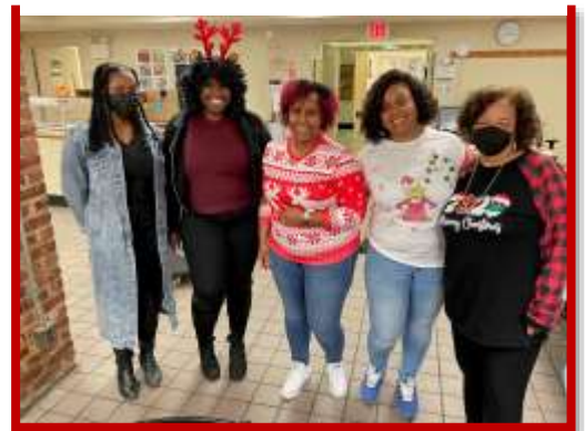
CIP Staff Holiday Party