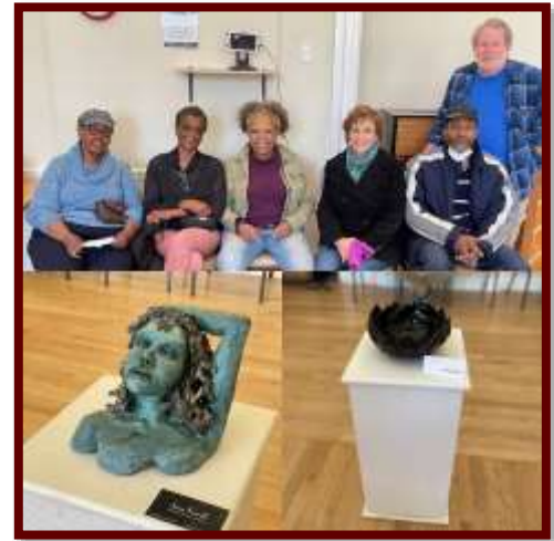
2021 Art Show: Pottery through the Pandemic

unit senior housing building located at 22 W. Rittenhouse Street that CIP co-developed in 2001. The Project was granted up to $3 million in funds from Affordable Rental Production & Preservation Housing Development administered by the City of Philadelphia's Division of Housing and Community Development (DHCD) pending an award of four percent (4%) Low Income Housing Tax Credits (LIHTC) from the Pennsylvania Housing Finance Agency (PHFA) for which our partnership has applied.