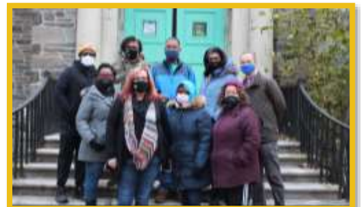
CIP Board Members and Executive Director, Winter Festival